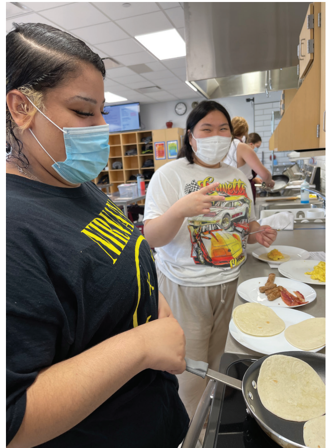
Students at Roseville Area High School learn how to cook in one of the new classrooms. Classes like this are part of the high school's Career Pathways program