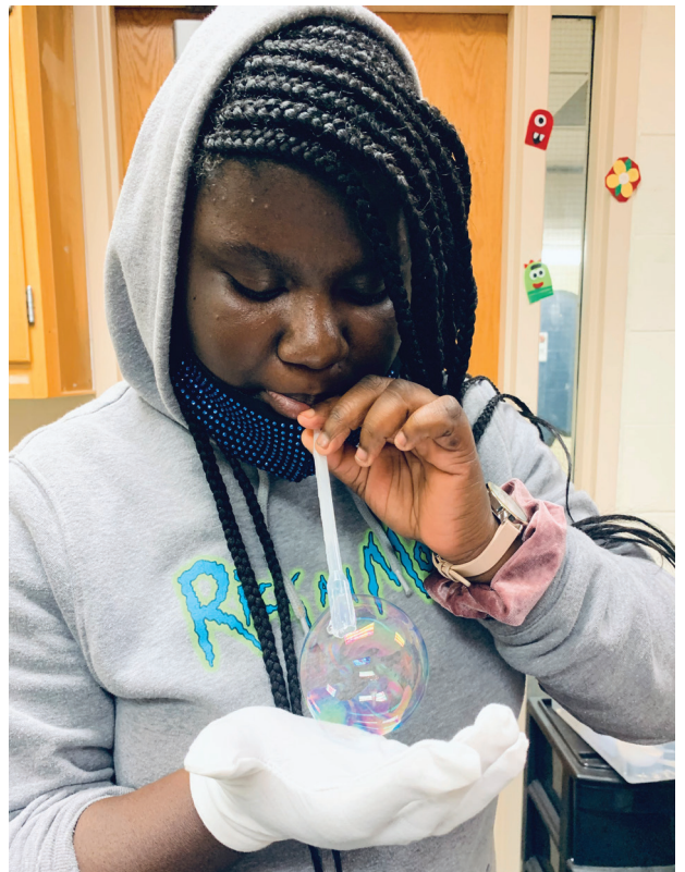
Learning about Unpoppable Bubbles was one of the STEM-in-a-Box activities.